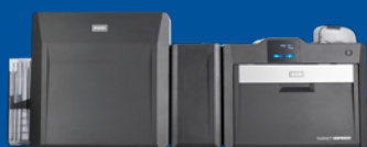
Dual-sided printer/encoder with lamination option