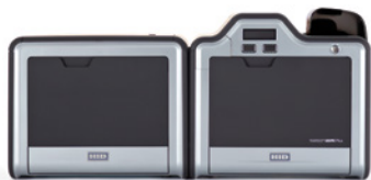
FARGO® HDPII PLUS

with optional dual-sided printing and lamination